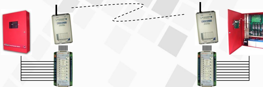
Simplified Illustration of Dry Contact Wiring Network